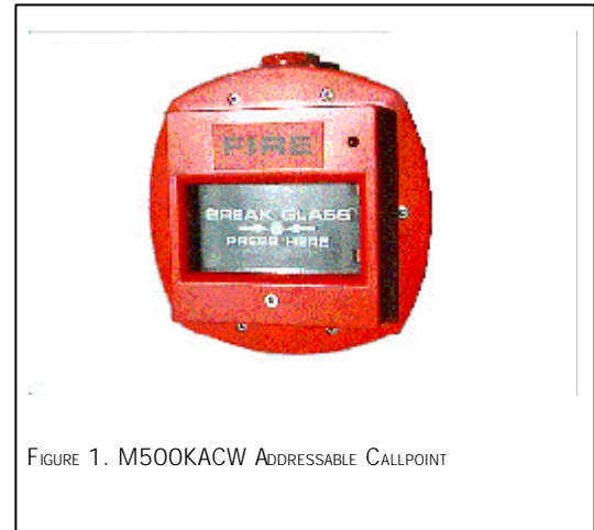
FIGURE 1. M500KACW ADDRESSABLE CALLPOINT